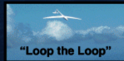
"Loop the Loop"